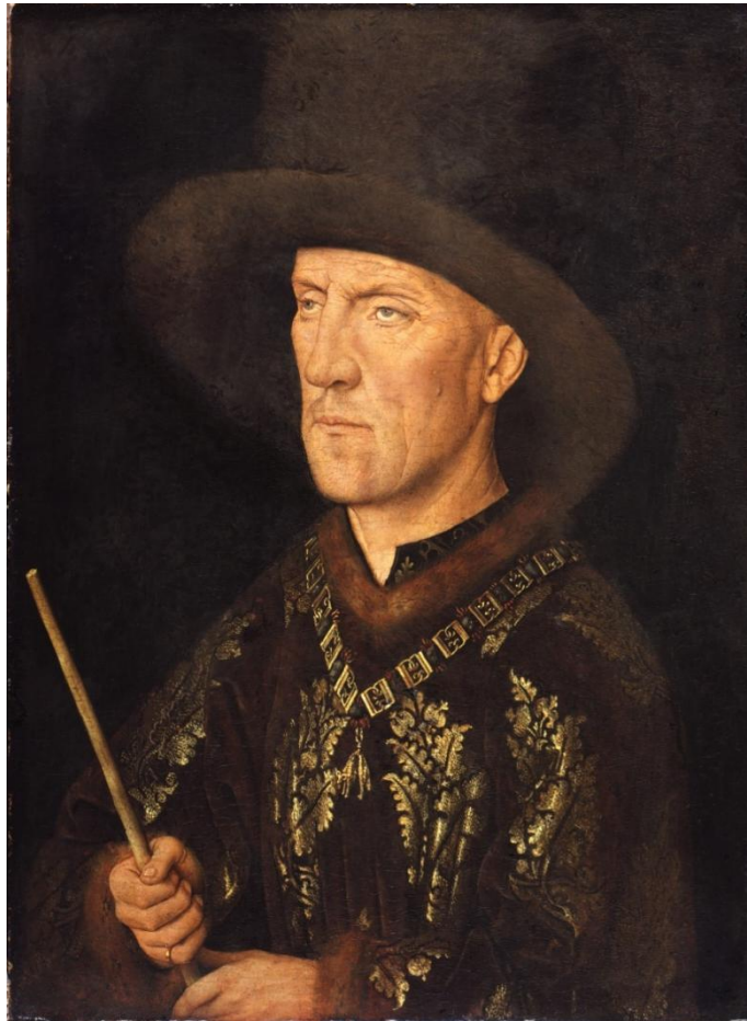
Jan van Eyck: Portrait of Baudouin de Lannoy, c. 1435-1440.

Oak panel, 26 x 19.5 cm. Berlin, Staatliche Museen, Gemäldegalerie. Source: www.boijmans.nl .