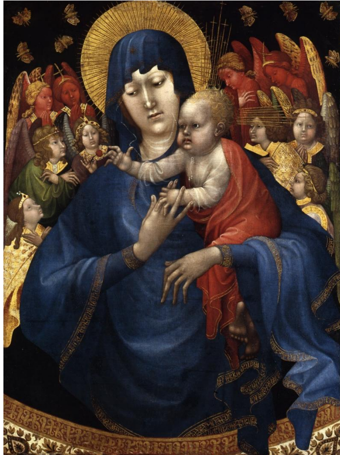
Jean Malouel (?): The Virgin with Angels and Butterflies , c. 1410.

Canvas, 107 x 81 cm. Berlin, Staatliche Museen, Gemäldegalerie.