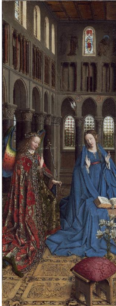
Jan van Eyck: The Annunciation. c. 1430-1435.

A Panorama of Northern European fine art in the first half of the 15 th - century